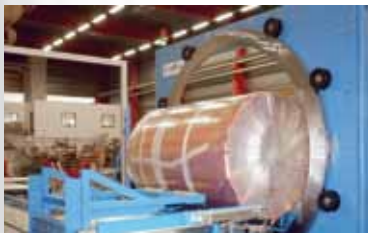
Special application for drums and reels