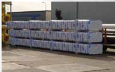
Automatic packaging for pipe bundles