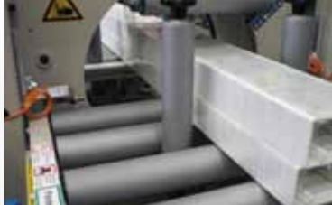
Inline solution for fully automatic packaging