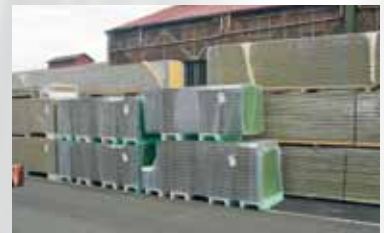
Packaging with Power Prestretch for Film Tension up to 400%.