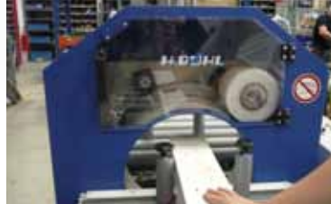
Semi automatic BSB-45 SX-2 with 125 mm filmwidth