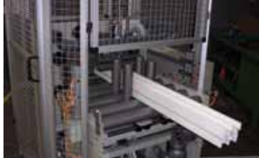
Fully automatic JUNIOR/S-450VA with 125 mm filmwidth