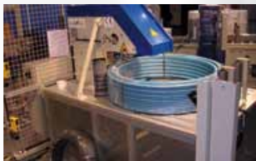
Horizontal wrapping machines for coils. Semi- and fully automatic solutions for a weight up to 10t