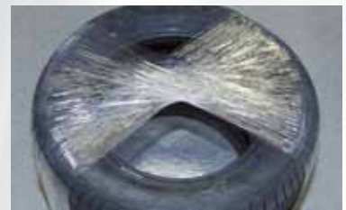
Special application for tyres