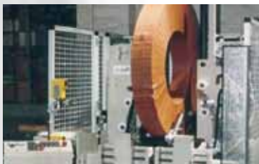
Vertical wrapping machines for crane or forklift truck loading Semi- and fully automatic solutions