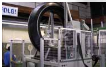
Vertical wrapping of huge coil dimensions