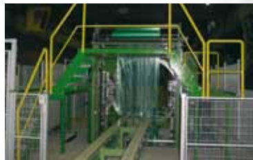
Inline Solution for packs with 6-side packaging